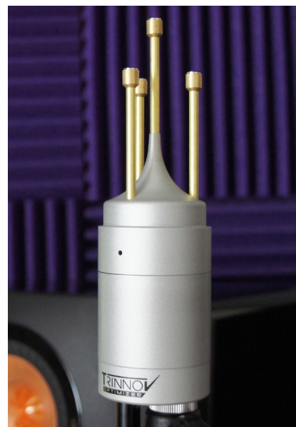
The 3D mic allows the ST2 Pro to separately identify the direct sound, early reflections and the longer 'wash' of reverb.

Along with its hardware processing box, the ST2 Pro system ships with a calibrated analysis microphone. And again, where the ARC and Sonarworks measuring microphones are based on relatively simple omnidirectional capsules, the Trinnov mic is a far more sophisticated device. It not only measures audio level and arrival time but also direction, in both the horizontal and vertical planes. It does this through deploying not just one microphone capsule but four, positioned in a tetrahedral arrangement that's not dissimilar to the Ambisonic arrays of the Rode NT-SF1, Sennheiser Ambeo VR and Zoom H3-VR. The great advantage of being able to discern the direction of audio signals arriving at the microphone is that the Trinnov system is able to create a 3D map of the soundfield in the room and so discriminate between the signals arriving directly from the monitors, those arriving via early reflections, and those