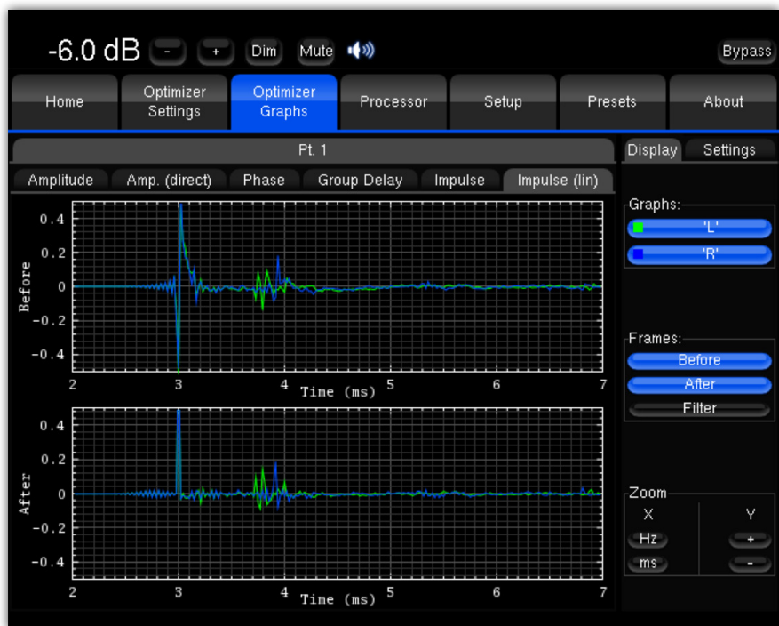
Screen 3: The before and after impulse responses illustrate well the impressive results of the ST2 Pro's phase correction.

100Hz time period, which works out at 10ms. Now, my KEF LS50s display relatively benign levels of low-frequency phase change, but many other monitors will display at least twice the level of phase change, and a few perhaps more than three times as much. Phase-equalising such monitors at low frequencies might put their overall latency into next week!